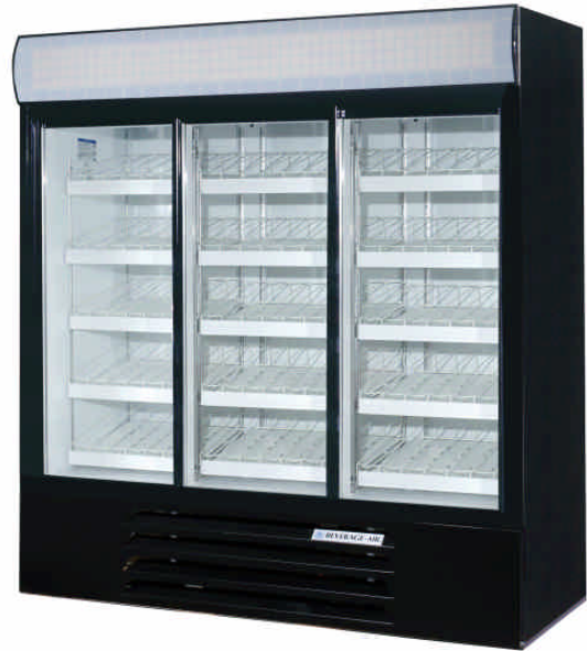
LV66 (shown with optional Gravity Flo Kit and extra shelving)