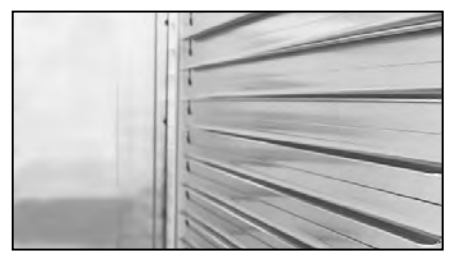
Extruded Channel Type Ledges