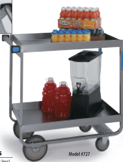
Freight Class: 125 Ships in: 6 days or less!