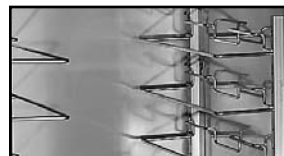
Adjustable Tray Slides