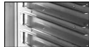
Sheet Pan Tray Slides