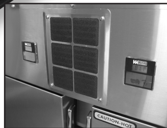
Dual light powered thermometers

Ideal for maintaining proper temperatures of bulk food during transport.