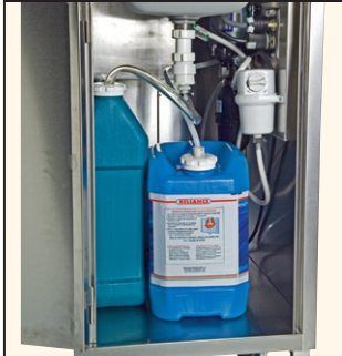
Interior view of Model 9620