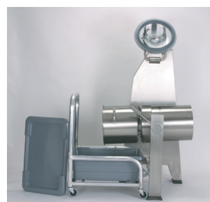
FOOD CART SHOWN WITH VCM