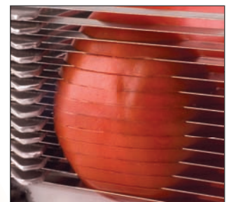
Blades are razor-sharp stainless steel for a smooth, precise cut.