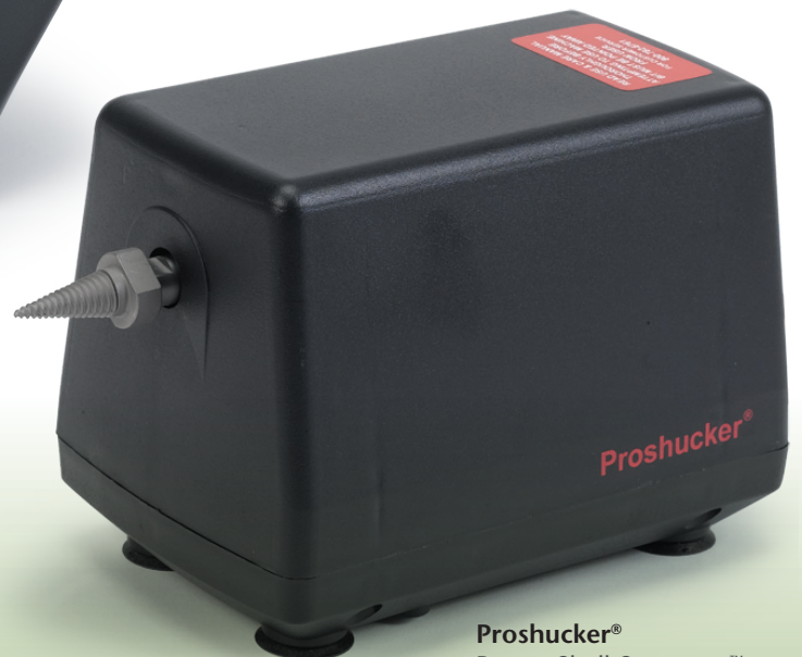
Proshucker® Power Shell Separator™