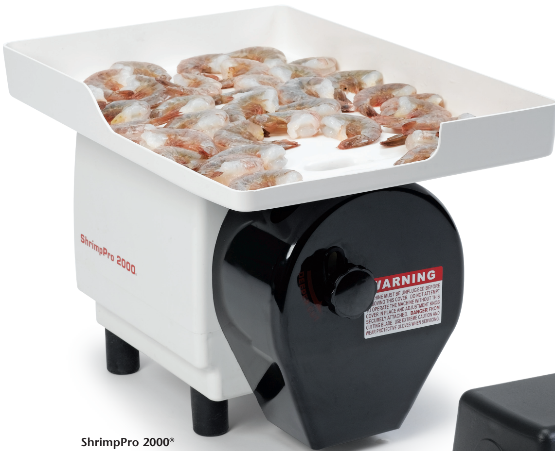
ShrimpPro 2000® Power Shrimp Cutter & Deveiner™

Make more money on the immense popularity of seafood with these machines that maximize productivity and labor efficiency!