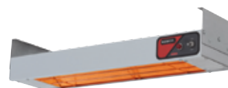
Model 6150-24, with hanging brackets