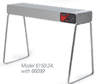
Model 6150-24, with 66099

Power option: Standard on/off toggle switch (shown) or 'infinite' temperature control dial for varying low, medium and high heat settings