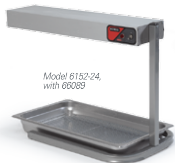
Model 6152-24, with 66089