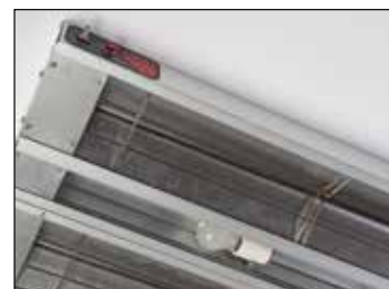
Optional showcase lighting adds visual appeal