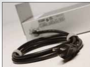
Optional cord-and-plug units simplify installation