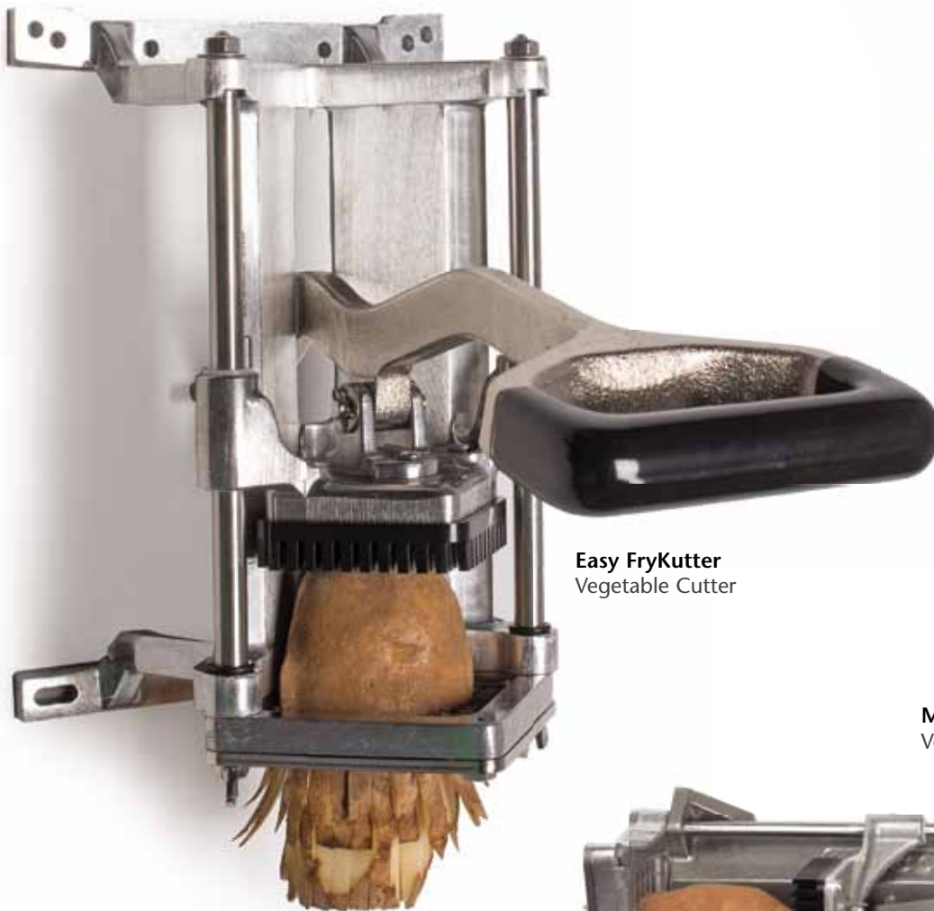
Easy FryKutter Vegetable Cutter

Choose Easy FryKutter for labor savings and improved productivity. Or power through the biggest spuds at lightning speed with the one and only Monster FryKutter.