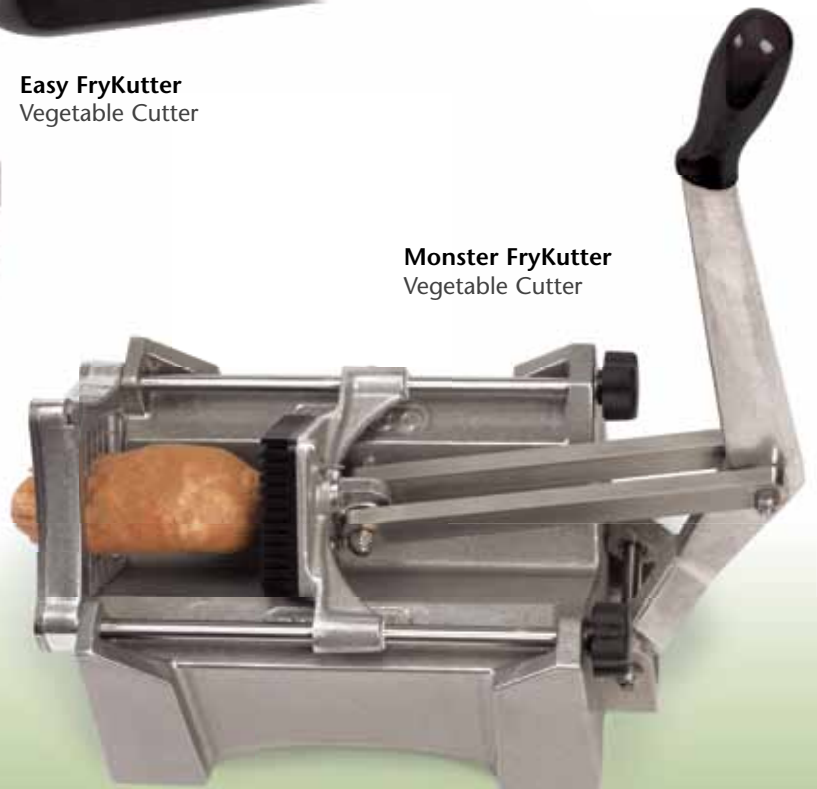
Monster FryKutter Vegetable Cutter