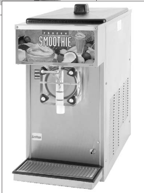
Model 5311 or 5511