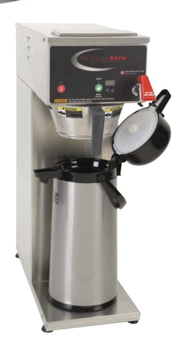
Model B-SAP (Airpots sold separately)