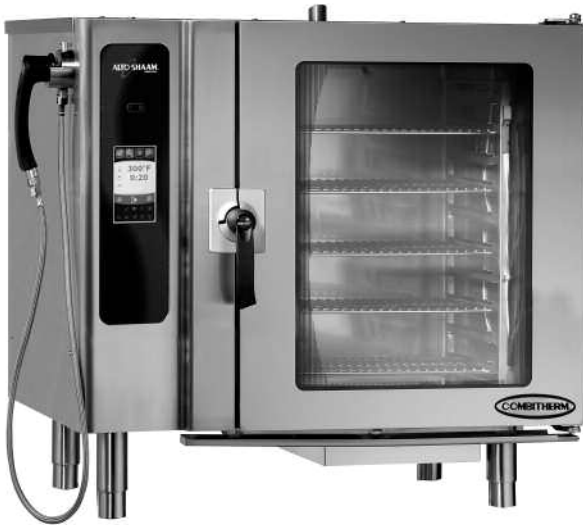
MODEL 10•10ESI WITH COMBITOUCH CONTROL CAPACITY OF TEN (10) FULL-SIZE OR GN 1/1 PANS, TEN (10) HALF-SIZE SHEET PANS

• Intuitive CombiTouch control is fully operable from the touch screen.