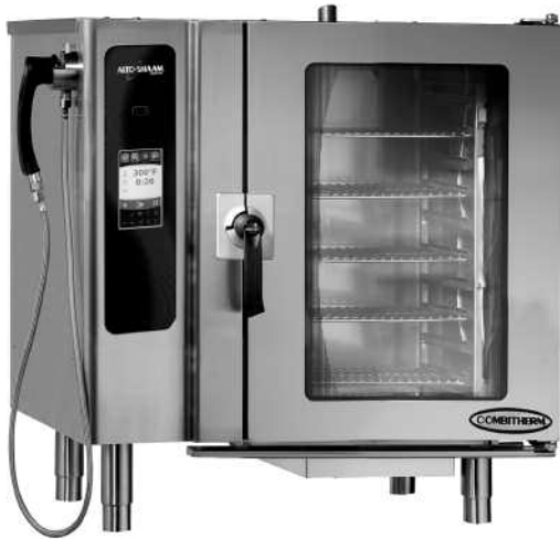
MODEL 10•10ESiN WITH COMBITOUCH CONTROL NARROW FOOTPRINT ANSWERS THE NEED FOR SPACE LIMITATION CAPACITY OF TEN (10) FULL-SIZE OR GN 1/1 PANS, TEN (10) HALF-SIZE SHEET PANS