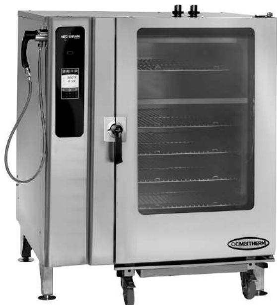
MODEL 12•20ESI WITH COMBITOUCH CONTROL ROLL-IN PAN CART INCLUDED CAPACITY OF TWENTY-FOUR (24) FULL-SIZE OR GN 1/1 PANS, TWELVE (12) FULL-SIZE SHEET OR GN 2/1 PANS

• Intuitive CombiTouch control is fully operable from the touch screen.