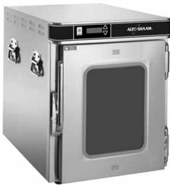
500-E / Deluxe

Single compartment holding cabinet with 22 gauge non-magnetic stainless steel exterior and door. The door is furnished with one (1) magnetic door latch with positive catch. The cabinet is controlled by one (1) on/off adjustable thermostat, 60° to 200°F (16° to 93°C); includes one (1) indicator light; and one (1) holding temperature gauge to monitor interior air temperature. The cabinet interior includes three (3) sets of pan slide supports spaced at 4-3/8" (111mm) centers attached directly to the inside walls of the cabinet. The supports are designed to accommodate 4" (102mm) deep full-size pans (GN 1/1). The exterior cabinet is furnished with four (4) carrying handles. Two (2) standard warmers can be stacked without additional hardware. Optional latches available to secure cabinets for transport.