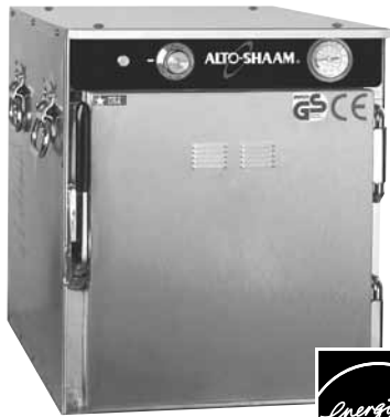
500-E / HD