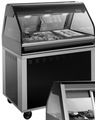
EU2SYS-48 FRONT VIEW SHOWN WITH OPTIONAL CASTERS