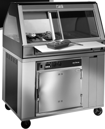
EU2SYS-48 BACK VIEW SHOWN WITH 750-TH-II COOK & HOLD OVEN AND OPTIONAL CASTERS