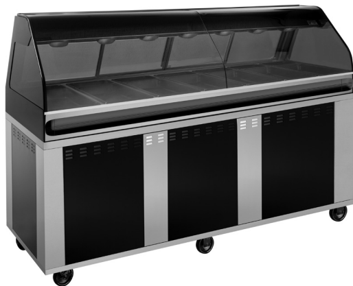
EU2SYS-96 FRONT VIEW SHOWN WITH OPTIONAL CASTERS

The display case is constructed of 18 gauge, non-magnetic stainless steel. A curved, tempered glass front encloses the display case and can be lifted to a 90 degree angle for easy cleaning. Removable, sliding glass doors on the operator side are included. Sliding door tracks have a "clean sweep" cutout allowing for easy cleaning and crumb removal. Framed end clear glass with rubber gasket material protects glass edges from chipping and breakage. The base is divided into three (3) individually managed heat zones with each zone controlled by a separate thermostat with a range of 1 through 10 and heat-on indicator light. Overhead lights are controlled by ON/OFF switches in three (3) light zones. Two (2) 125V plug outlets are available as an option on 120/208-240V units only. Decorator base includes one set of leveling bolts.