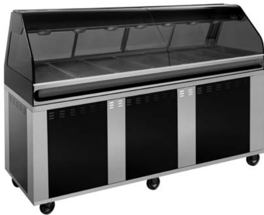
EU2SYS-96 FRONT VIEW SHOWN WITH OPTIONAL CASTERS

The display case is constructed of 18 gauge, non-magnetic stainless steel. A curved, tempered glass front encloses the display case and can be lifted to a 90 degree angle for easy cleaning. Removable, sliding glass doors on the operator side are included. Sliding door tracks have a "clean sweep" cutout allowing for easy cleaning and crumb removal. Framed end clear glass with rubber gasket material protects glass edges from chipping and breakage. The base is divided into three (3) individually managed heat zones with each zone controlled by a separate thermostat with a range of 1 through 10 and heat-on indicator light. Overhead lights are controlled by ON/OFF switches in three (3) light zones. Two (2) 125V plug outlets are available as an option on 120/208-240V units only.