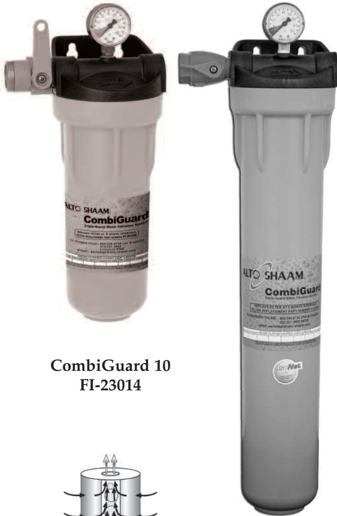
CombiGuard 10 FI-23014