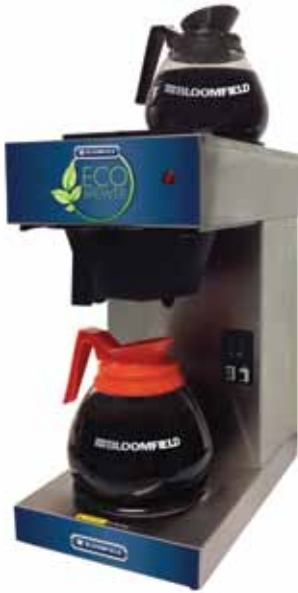
Model 4543-D2 (decanters sold separately)