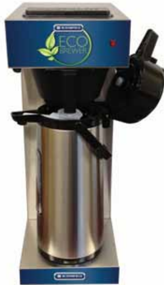
Model 4774-A (Airpot sold separately)

ENERGY SAVINGS OF UP TO 20%* OVER TRADITIONAL "TANK" STYLE UNITS. *The quote doesn't include the decanters.