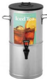
8799 - 3 Gallon