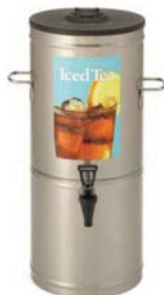
8802 - Five Gallon