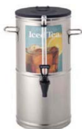
8699 - Three Gallon with sight glass

❑ 8799-3G ❑ 8699-3G-SG ❑ 8802-5G ❑ 8602-5G-SG ❑ 4G-35-NTD