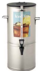
8602 - Five Gallon with sight glass