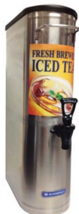
4G-35-NTD - Four Gallon