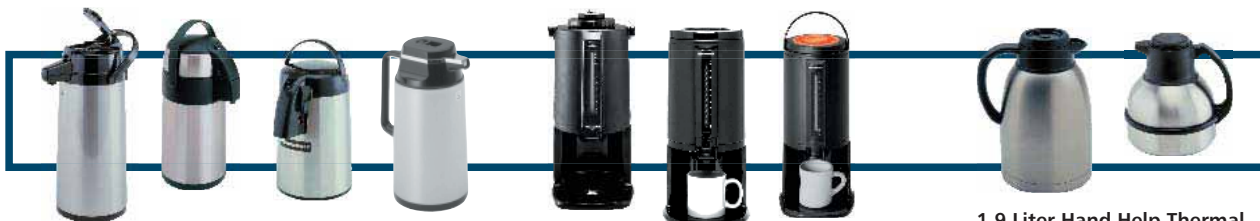
Complete line of airpots are compatible with this model using the Brew Buddy (p/n 3774)

ACCESSORIES: See the Bloomfield Brew Brew product catalog for a complete listing of brewers and accessories.