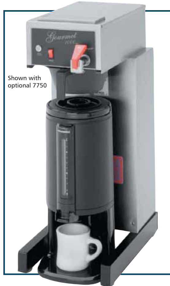
Shown with optional 7750