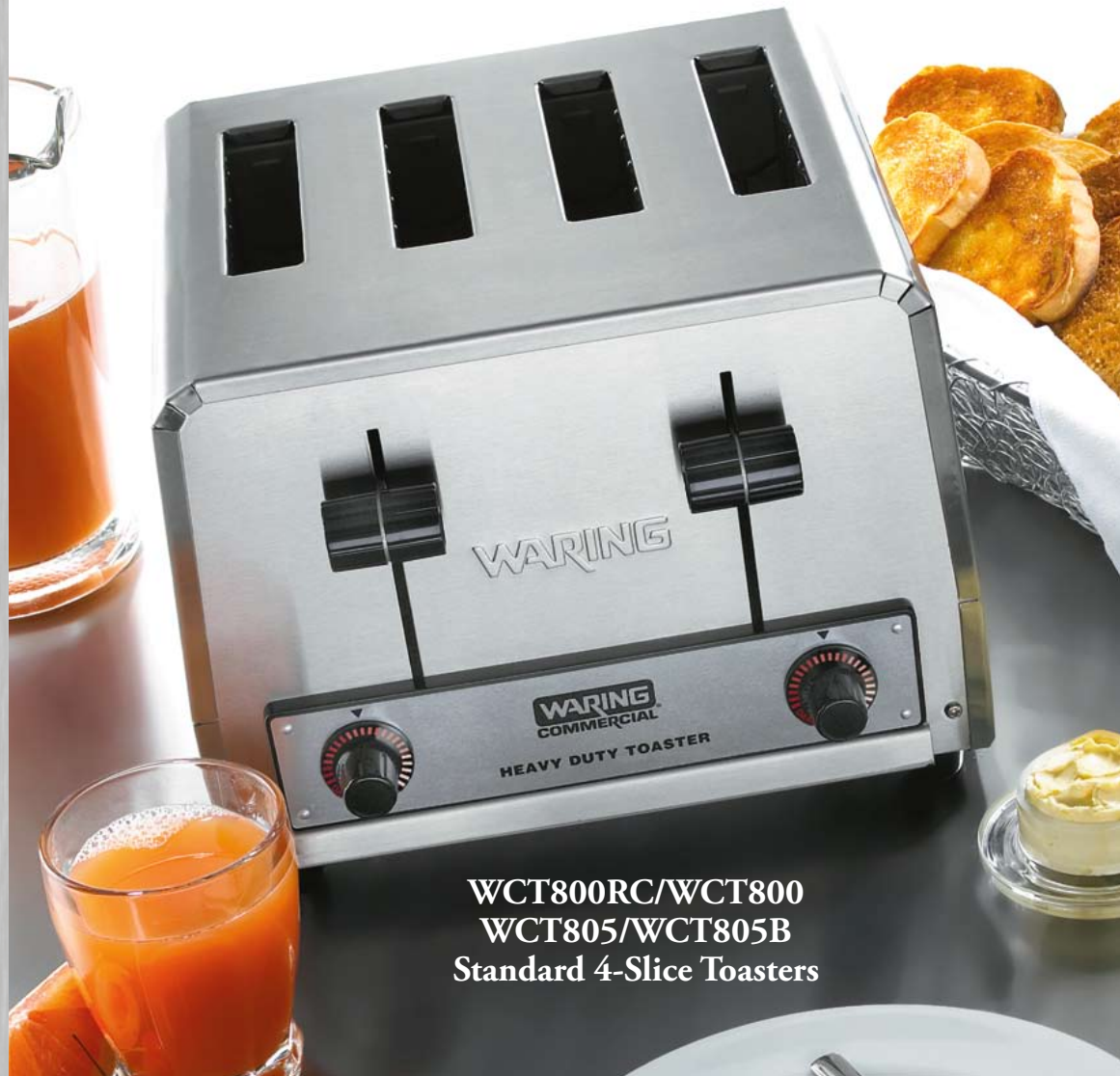
WCT800RC/WCT800 WCT805/WCT805B Standard 4-Slice Toasters