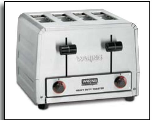
WCT820/WCT825/WCT825B Bagel Toasters