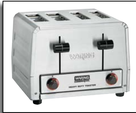
WCT810/WCT815/WCT815B Combination Toasters