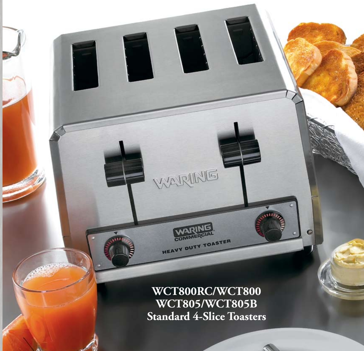
WCT800RC/WCT800 WCT805/WCT805B Standard 4-Slice Toasters