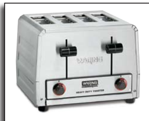
WCT820 Bagel Toaster