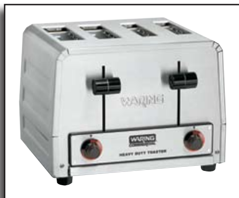
WCT810/WCT815/WCT815B Combination Toasters