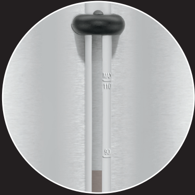
Sightglass for Viewing Brew Level