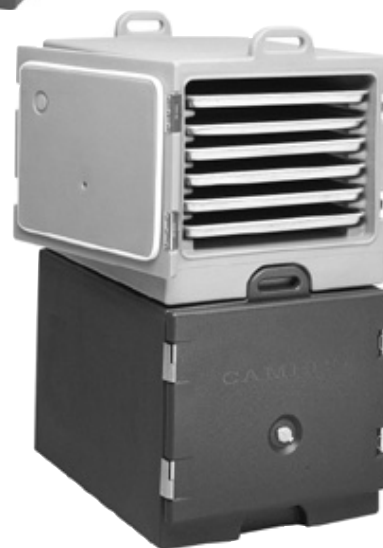
1826MTC (For Trays and Sheet Pans)