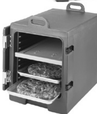
1318MTC (For GN Food Pans and Trays and Sheet Pans)