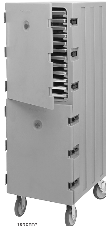
1826DTC (For Trays & Sheet Pans)