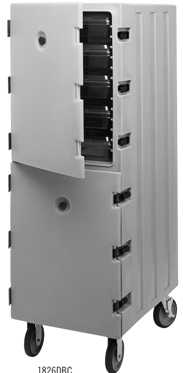
1826DBC (For Food Storage Boxes)