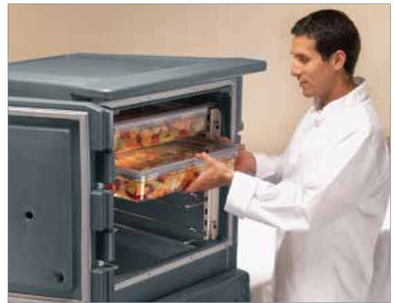
Both Hot or Cold and Hot Only Camtherm Cabinets are available in low and tall profile models.