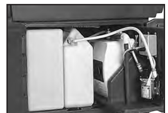
Tanks and Hot Water Heater