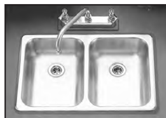
Two (2) Compartment Stainless Steel Sink