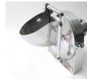
Food slicer 312GS