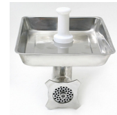
Meat grinder 302