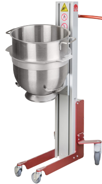
Bowl lift Easylift II