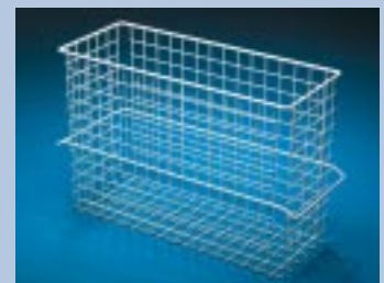
Products and specifications subject to change.

One epoxy-coated wire basket comes with all models. Extra baskets are available. For 5, 7 and 9 cu. ft. models (ST05G, ST07G and ST09G), order basket model 216657300. For 13, 15 and 20 cu. ft. models (ST13G, ST15G and ST20G), order basket model 216506100.