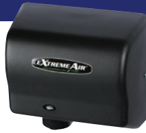
Steel Black Graphite