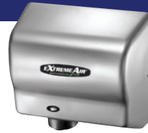
Steel Satin Chrome