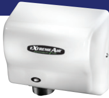
Steel White Epoxy