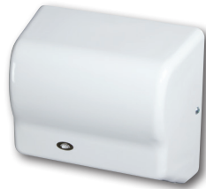
Steel White Epoxy