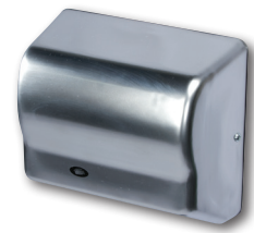
Steel Satin Chrome