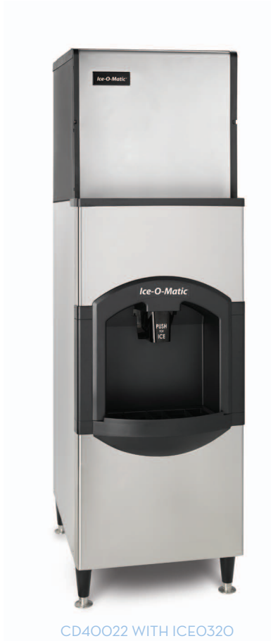
CD40022 WITH ICE0320