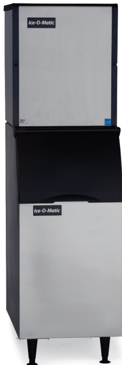
ICEO726 ON B42