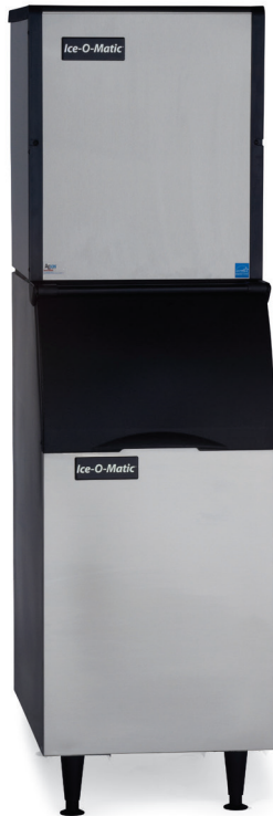
ICEO926 ON B42