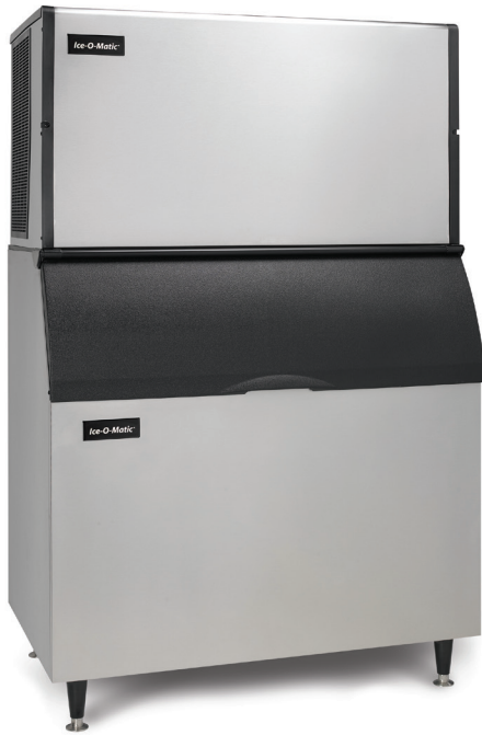
ICE1806 ON B100