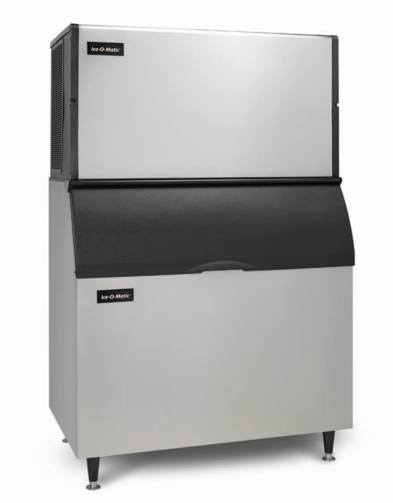
ICE2106 ON B100