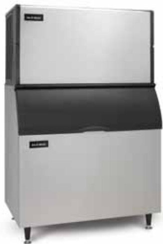
ICE2106 on B100