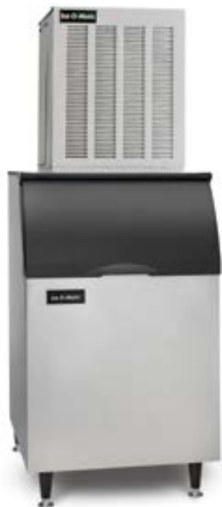
MFI1256 ON B55