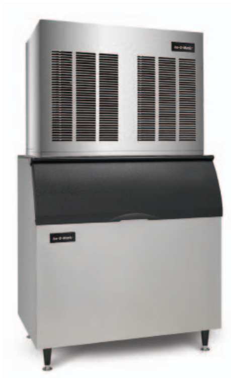
MFI2406 ON BIOO