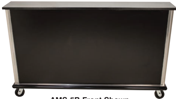
AMS-5B Front Shown

Custom Colors Available! (Exterior Only. See below for details)