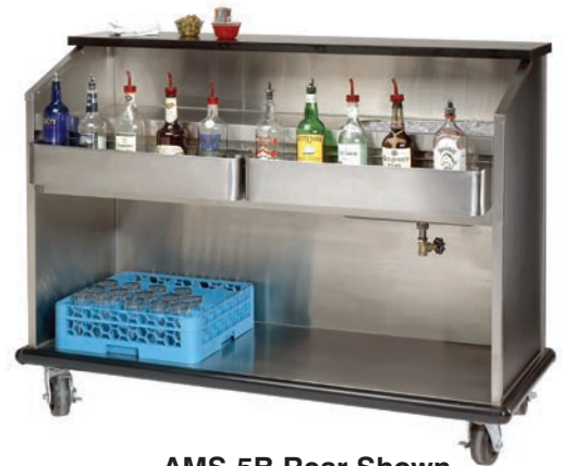
AMS-5B Rear Shown