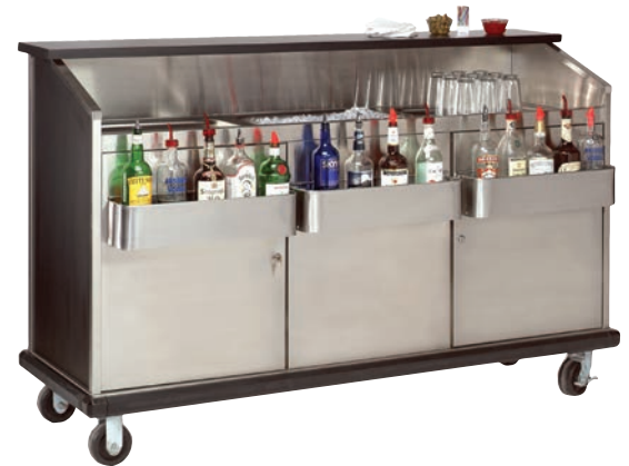
AMD-6B Rear Shown

*Units Include Center Stainless Steel Panel For Extra Support