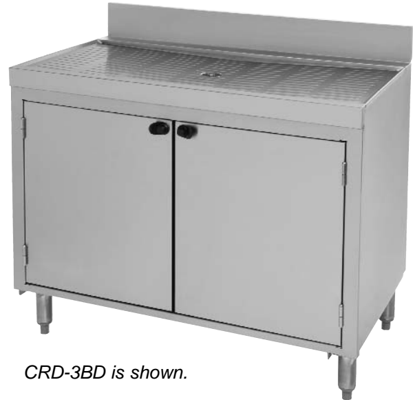
CRD-3BD is shown.