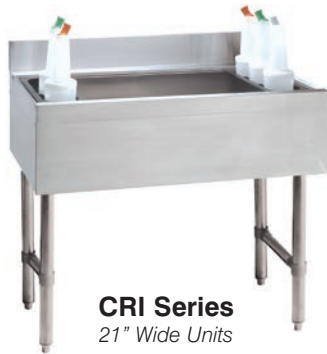
CRI Series 21" Wide Units