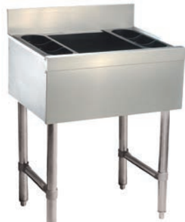
SLI Series 18" Wide Units