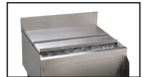
Optional Sliding Stainless Steel Cover Shown