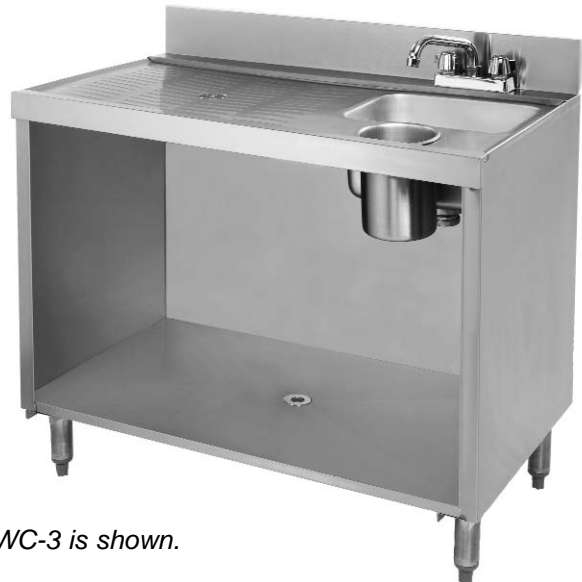
CRWC-3 is shown.

CRWC-18-DR CRWC-2B-DR CRWC-30-DR CRWC-3-DR CRWC-42-DR CRWC-4-DR