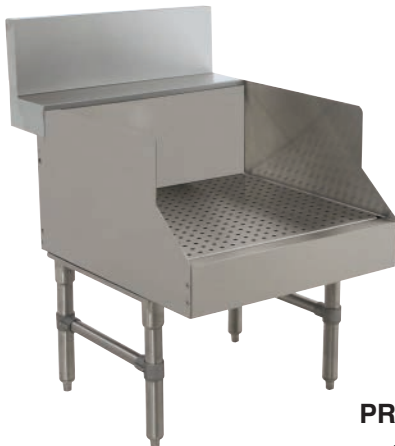
PRGS-24 Series 30" Wide Units