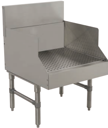
PRGS-19 Series 25" Wide Units