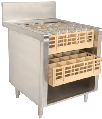
Open Top - PROR Series PROR-24-24 Shown