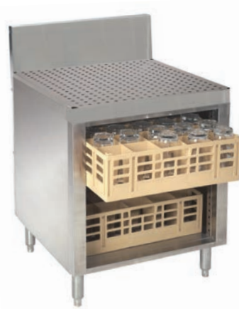
Drainboard Top - PRCR Series PRCR-19-24 Shown