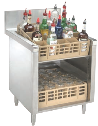
Slanted Top - PRSR Series PRSR-19-24 Shown