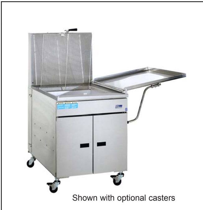
Shown with optional casters